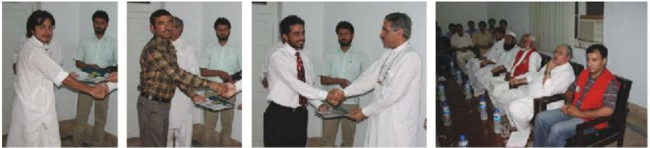
Vice Chancellor distributing certificates to the participants

The vice chancellor urged faculty to make it mandatory that students get first hand training in the department. On a comment, he remarked that the duration could be extended with practical training in the field, so that students fully grasp both the conceptual and practical parts. Later on, he gave away certificates to the participants. All the faculty and administrative officials were present on the occasion.