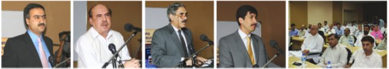
Speakers addressing the audience at CMS launching