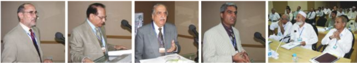
Speakers addressing on process of Accreditation of Engineering Programs

highlighted various steps of the manual including criteria of weightings, accreditation proformas, and need of accreditation.