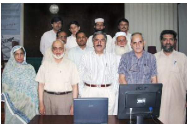
Staff of Directorate of Admissions, with Vice Chancellor

The test was conducted simultaneously at Col. Sher Khan Stadium (Peshawar), where 5507 male candidates and 159 female candidates appeared, at Abbottabad Center, where 935 male and 83 female candidates appeared, while at Bannu Center 603 male and 11 female candidates appeared.