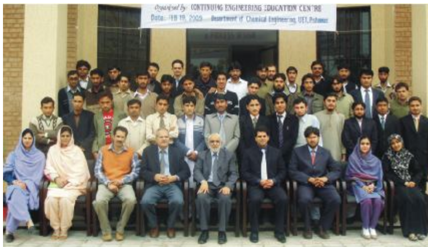
Group photo of seminar participants

Engineer. He presented an overview of process engineering by focusing on obstacles that come across in real design processing, and necessary skills required to cope effectively. His talk revolved around a notion "knowledge of the basic fundamentals is the foundation for successful professional practice". He explained how to conduct feasibility studies, conceptual design, front-end engineering design, detailed engineering design, construction, commissioning and operation. He said professionals should have a strong grasp on these aspects to work in complex settings.