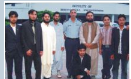
UET team with the Judge