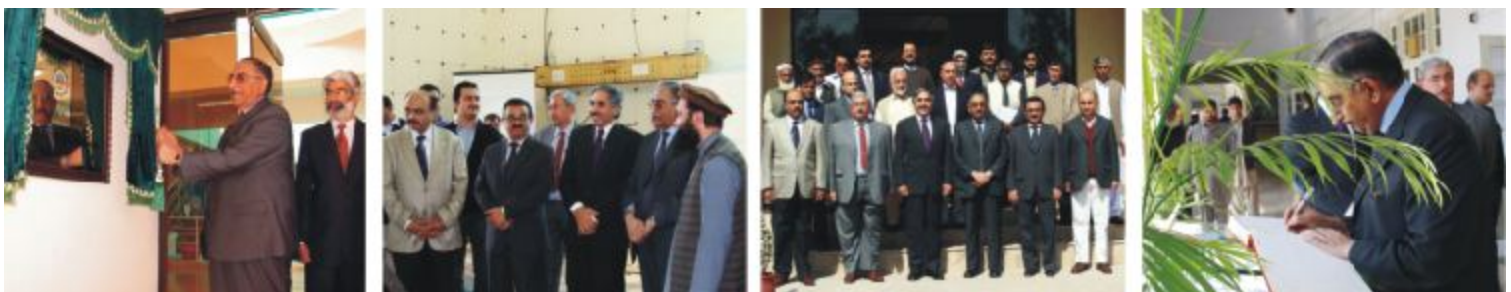
Glimpses of Dr. Samar Mubarakmand's visit

He appreciated the UET linkage program with foreign universities, and urged UET to invite partner universities to collaborate with departments of UET, and declare these as their external campuses. "Invite them to your campus, have them identify the gaps in existing set ups, and then develop PC-1 for the Planning Commission. We assure you that Planning Commission will facilitate you", he added. He said that European and UK universities have deep interest in getting good students from developing countries. It should be our priority to exploit this opportunity.