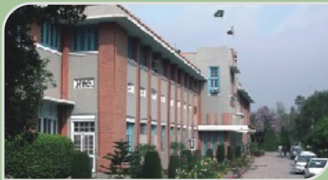
Main Campus, Peshawar