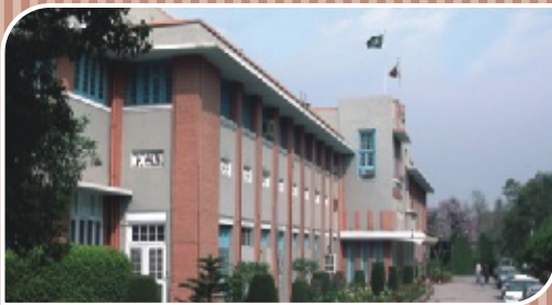
Main Campus, Peshawar