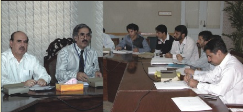
VC briefing media personnel about the establishment of UET new campus at Jalojai

The campus would be established on 350 acres of land, and will be equipped with state-of-the-art facilities of a world-class university, and linkages would be developed with foreign educational institutions.