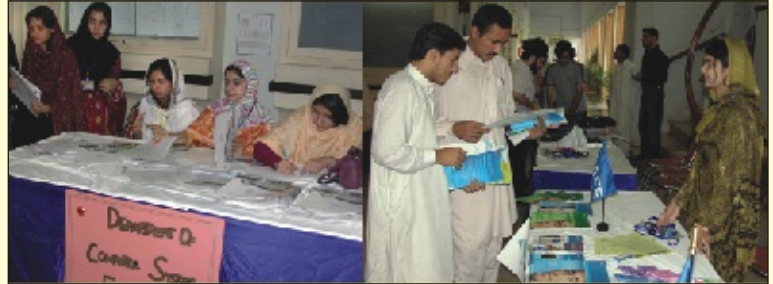
New comers being briefed on Orientation Day