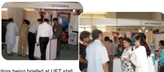
Visitors being briefed at UET stall