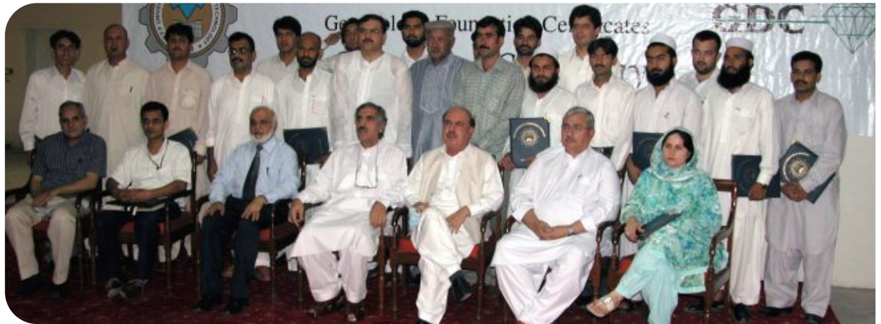
Students pose for group photo